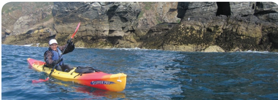
Jersey Kayak Adventures

Jersey Kayak Adventures was formed in 2003 by Gary Kemp and Derek Hairon. The company offers sea kayak tours and courses around Jersey's coastline suitable for paddlers of all ages and abilities including families with young children.